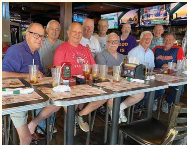
On July 30, 2021, the Class of 1965 gathered for lunch at the Winking Lizard in Independence, OH.