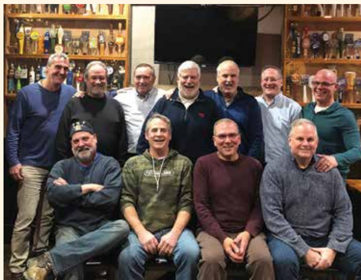
The 1979 class held a Christmas party @ The Winking Lizard in Bedford Heights, OH on December 16, 2021.