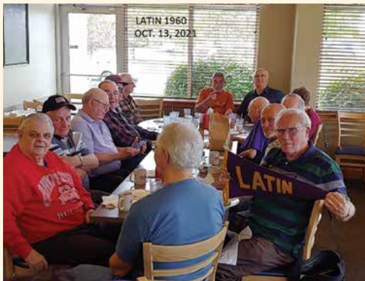
On October 13, 2021 the 1960 Class gathered at Goody's Family Restaurant in Brook Park, OH.