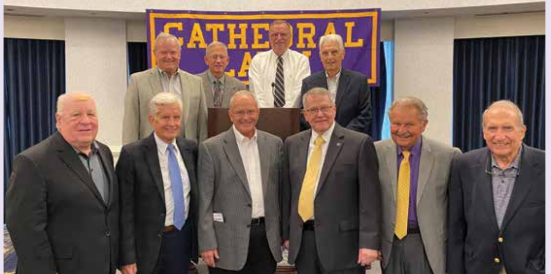
Class of 1962