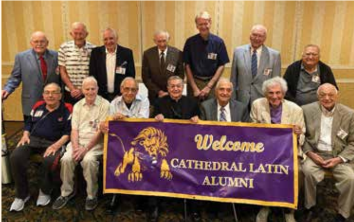
The Class of 1951 held their 70th reunion on August 23, 2021 at Alfredo's at the Inn in Mayfield Village, OH.