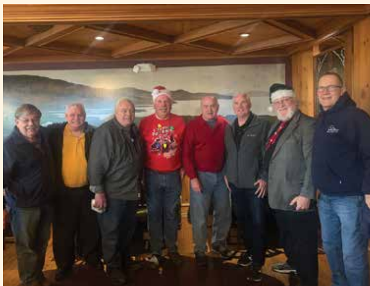
The Class of 1970 got together at The Harp in Cleveland, OH in December 2021.