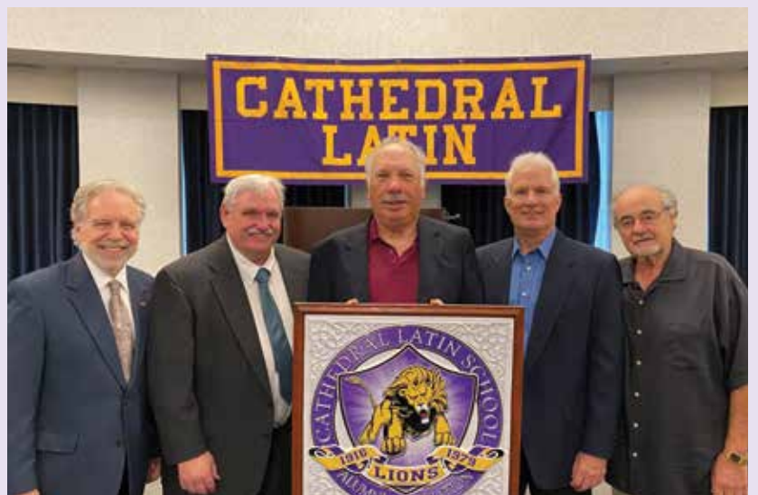
Class of 1970