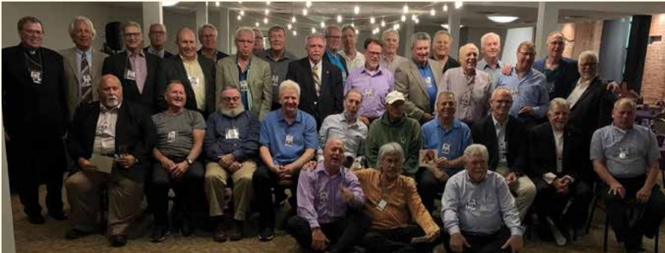
On Saturday, September 11, the 1971 Class celebrated their 50th reunion at Windows on the River (West Bank - The Flats) in Cleveland, OH.