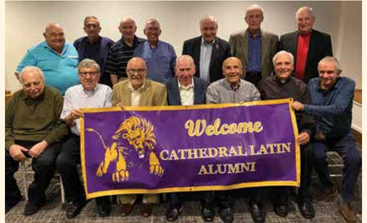
The Class of 1956 celebrated its 65th reunion on September 22, 2021 at Pine Ridge Country Club in Wickliffe, OH.