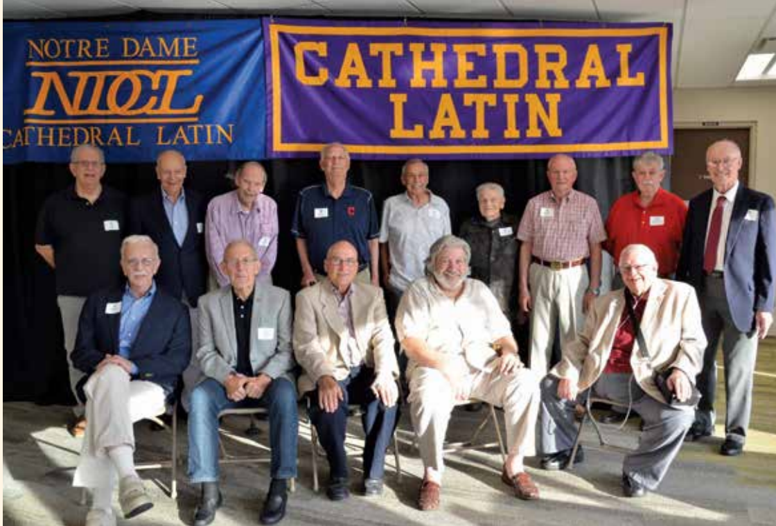
The Class of 1958 gathered at NDCL to celebrate their 60th reunion on Friday, June 8, 2018.