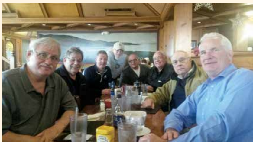
The Class of 1970 had a great time at The Harp on December 14, 2018.