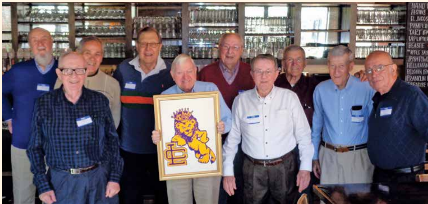
The Class of 1952 met for lunch at Market Garden Brewery & Distillery on Thursday, October 18, 2018 to celebrate their 66th reunion.