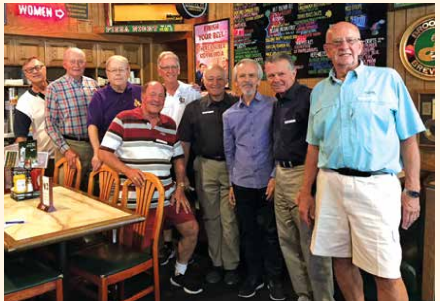
The Class of 1963 held their 55th Class Reunion at Muldoon's Eatery on Saturday, August 4.