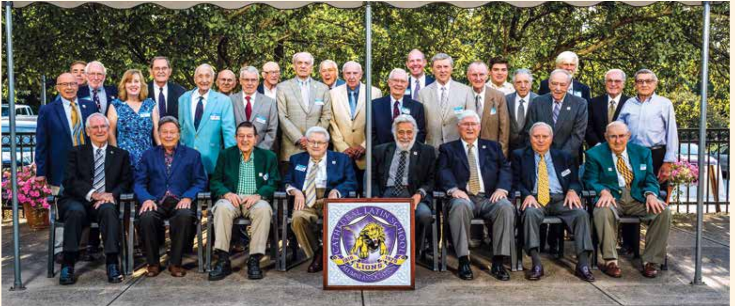
On Saturday, August 4, members of the Class of 1953 held their 65th Class Reunion at Pine Ridge Country Club.