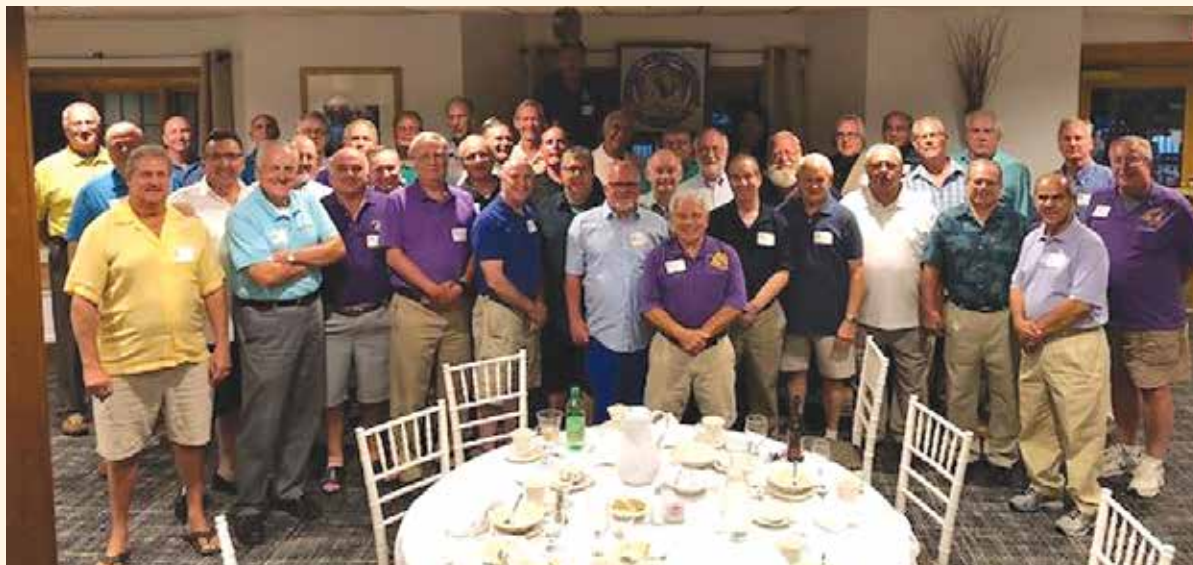
The Class of 1968 held their 50th Class Reunion at Pine Ridge Country Club on Saturday, July 14.