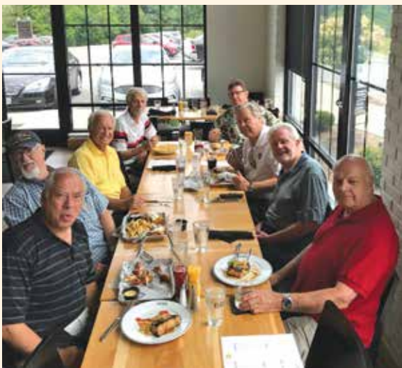
The Class of 1961 gathered at Brim Kitchen & Brewery in Willoughby, OH on July 20.