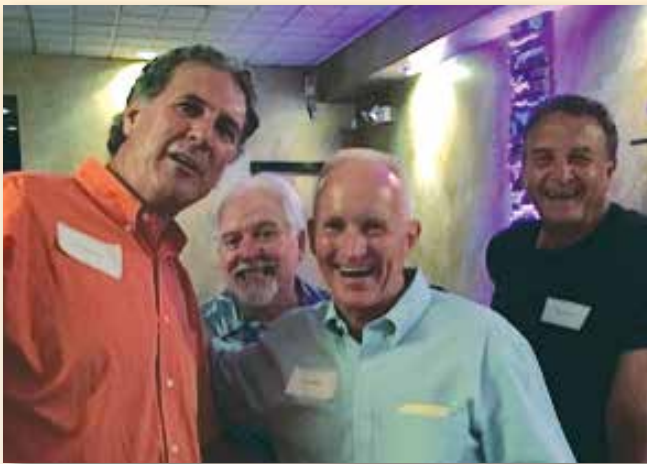
The Class of 1970 met at Nido Italia in Little Italy on Sept. 5, 2015 to celebrate their 45th reunion.