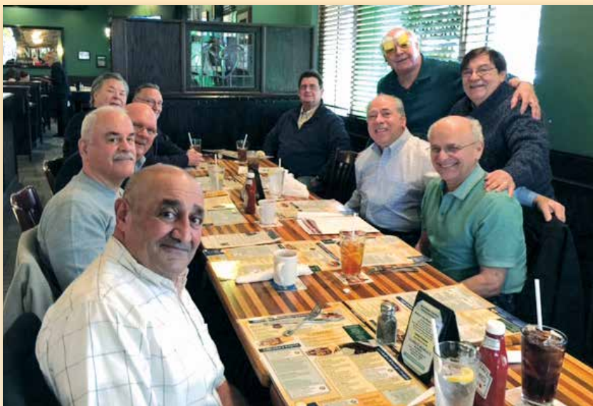
The Class of 1961 held a luncheon on April 10, 2015 at Mavis Winkles Irish Pub in Independence, Ohio.