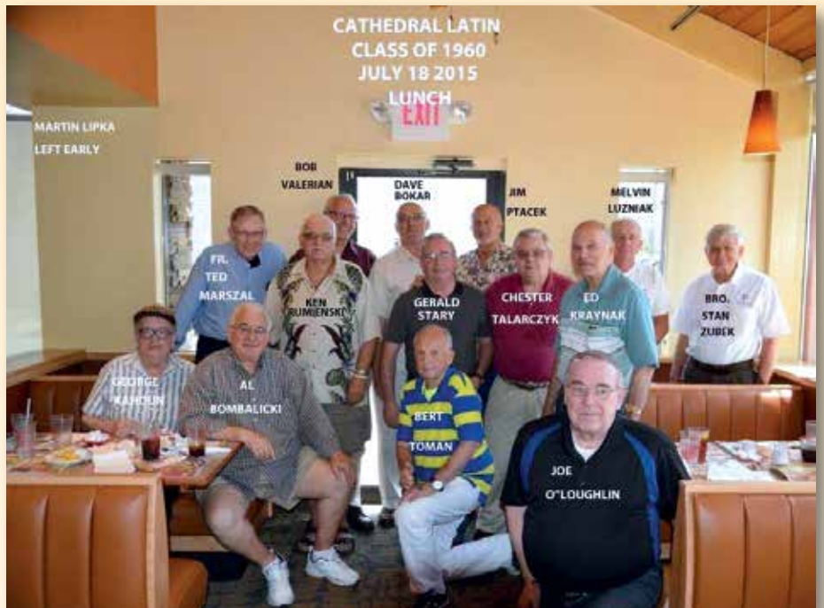
The Class of 1960 got together on July 18, 2015 to celebrate their 55th reunion at Bob's Big Boy.