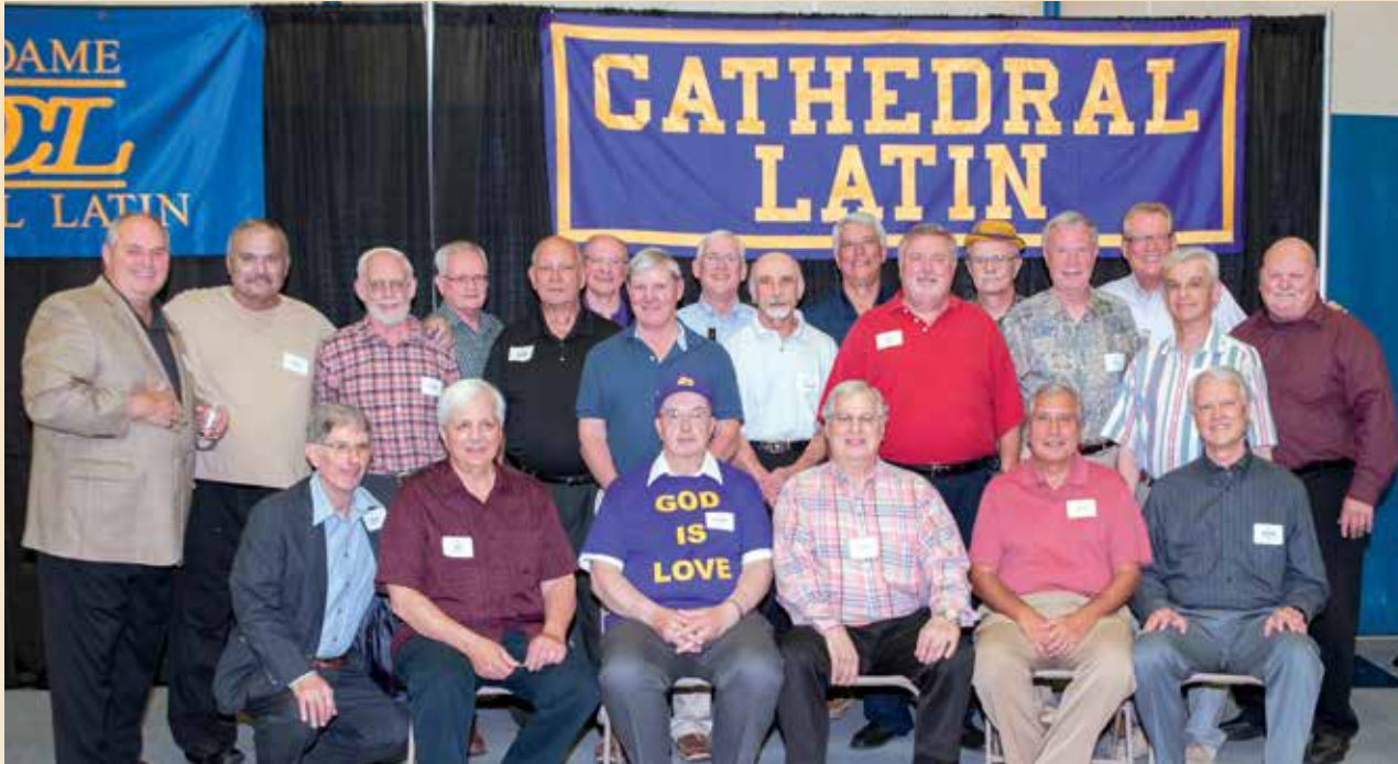
The Class of 1965 gathered at NDCL's reunion weekend on Friday, June 5, 2015. They celebrated their 50th reunion on Saturday, June 6 at Pickwick & Frolic with 55 classmates.