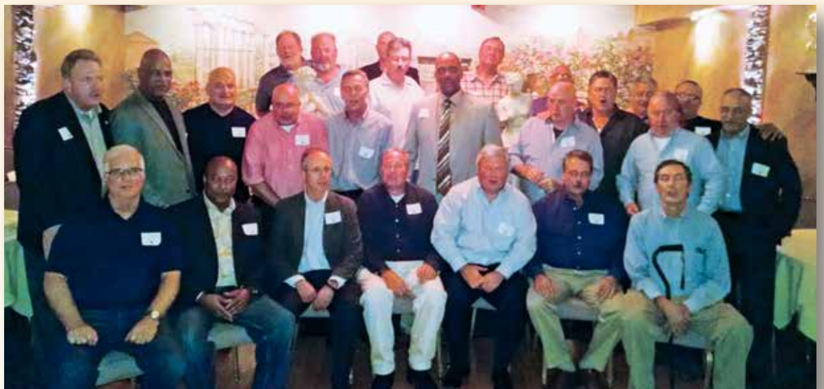
The Class of 1975 celebrated their 40th reunion on Saturday, Sept. 26, 2015 at Nido Italia in Little Italy.