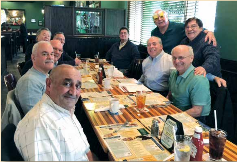
The Class of 1961 held a luncheon on April 10, 2015 at Mavis Winkles Irish Pub in Independence, Ohio.