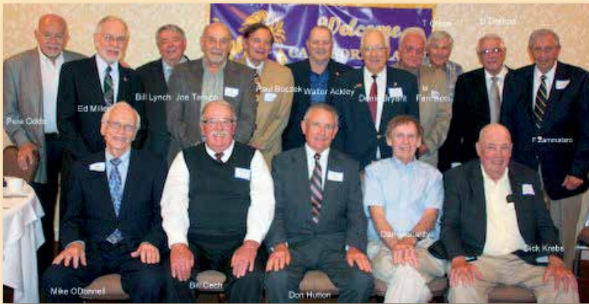
The Class of 1955 celebrated their 60th reunion on July 17, 2015 at the Hilton Garden Inn in Twinsburg, Ohio.