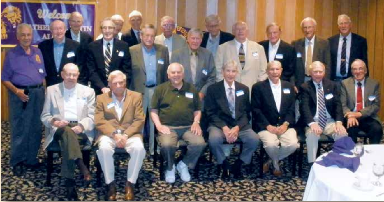
The Class of 1950 celebrated their 65th reunion on Saturday, Sept. 19, 2015 at Lakeside Yacht Club.