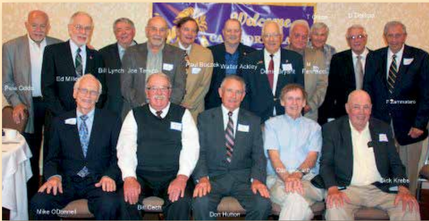
The Class of 1955 celebrated their 60th reunion on July 17, 2015 at the Hilton Garden Inn in Twinsburg, Ohio.