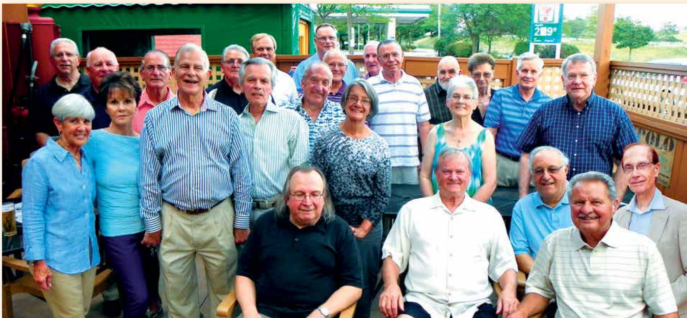
The Class of 1962 and their guests met for lunch on July 31, 2015 at Muldoon's Eatery & Saloon.