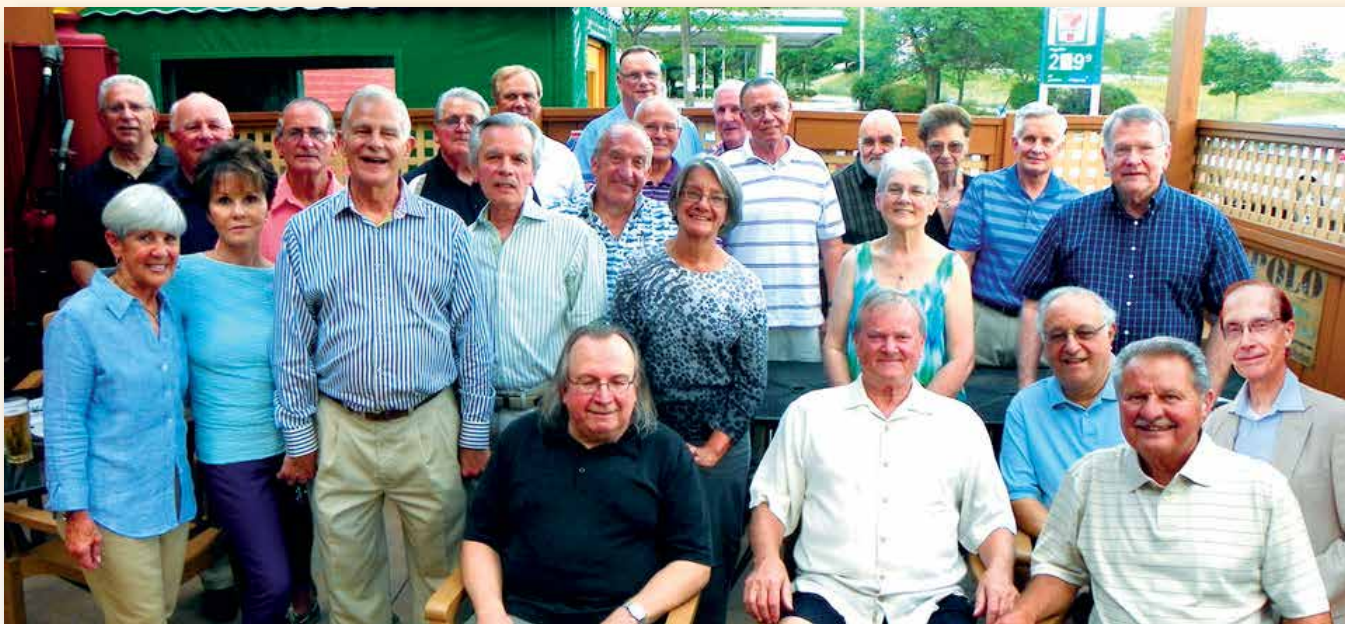
The Class of 1962 and their guests met for lunch on July 31, 2015 at Muldoon's Eatery & Saloon.