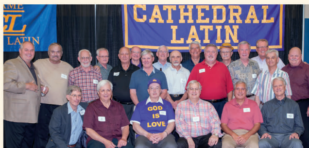
Class of 1965