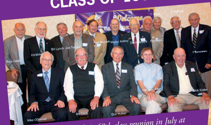
The 1955 Class held their 60th class reunion in July at the Hilton Garden in Twinsburg, Ohio.