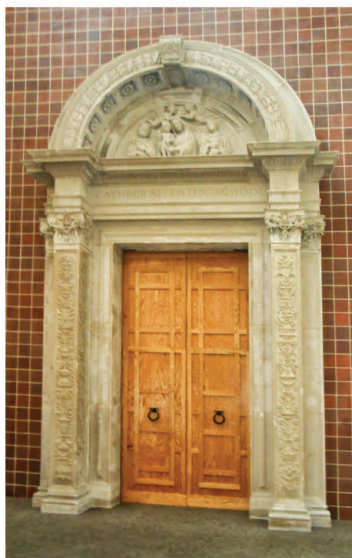
CATHEDRAL LATIN SCHOOL ARCHWAY W.O. WALKER BUILDING ATRIUM EAST 107TH STREET • CLEVELAND, OHIO