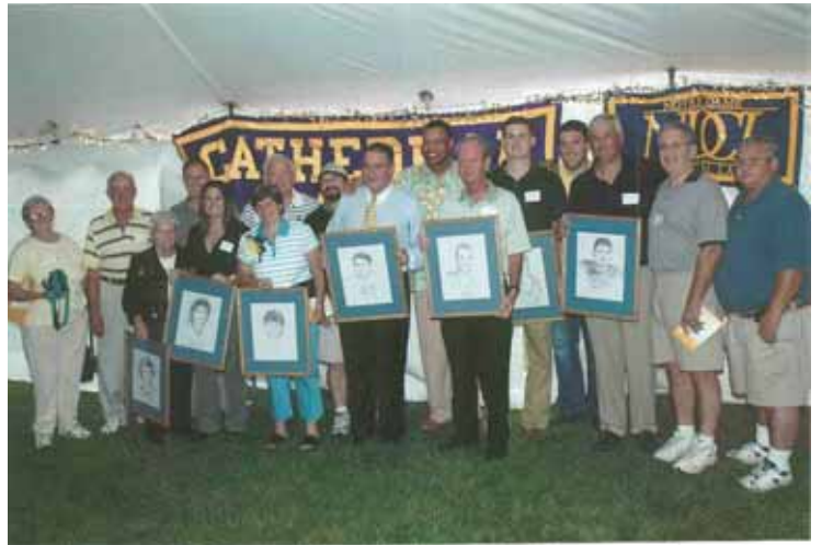
Past Hall of Famers join new inductees for a photo at the 2006 Athletic Hall of Fame Ceremony at NDCL.