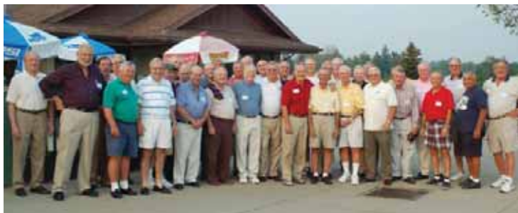
Class of 1956 members show off their stylish golf fashion outside the clubhouse at Briarwood Golf Course.