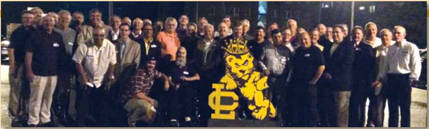
The Class of 1969 gathered at Nighttown on July 19, 2014 to celebrate their 45th reunion.