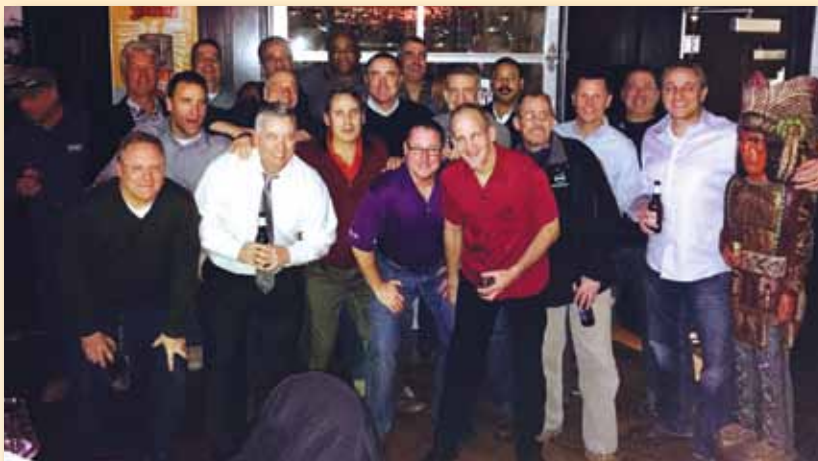
The 1979 Class got together to celebrate their 35th reunion at Wink's Bar & Grill on December 23, 2014.