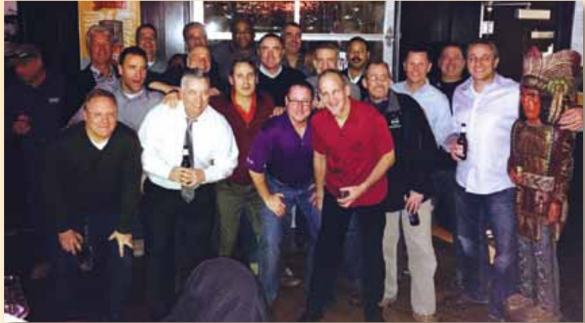
The 1979 Class got together to celebrate their 35th reunion at Wink's Bar & Grill on December 23, 2014.