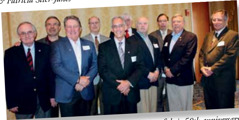
The 1964 Class were honored on the occasion of their 50th anniversary.