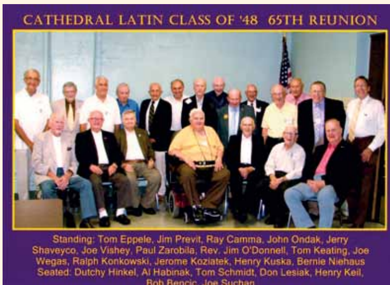
The 1948 Class held their 65th reunion on August 31, 2013 with Mass and a great dinner at St. Monica's Church.

We would like to thank everyone who attended this wonderful event. Next year's Communion Breakfast will be Sunday, April 26, 2015, so please save the date. We hope you can join us for this wonderful affair.