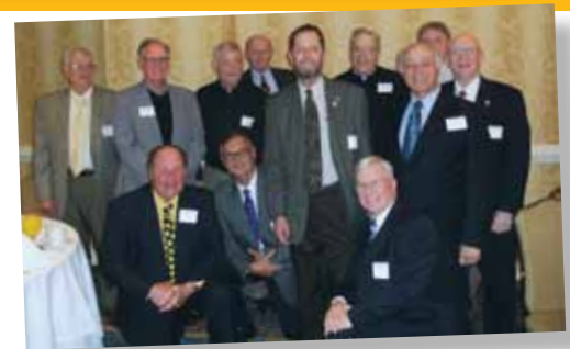
1963 Class honored for their 50th Anniversary

We would like to thank everyone who attended this wonderful event. We hope you can join us next year on Sunday, April 27, 2014 for this special affair.