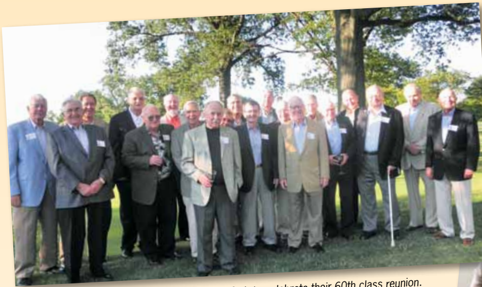
The Class of 1952 gathered at Acacia County Club to celebrate their 60th class reunion.