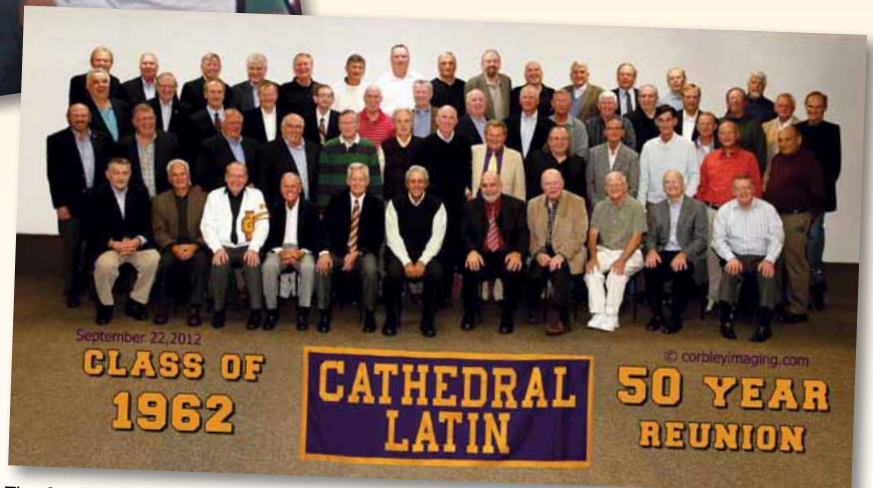
The Class of 1962 celebrated their 50th reunion at Pleasant Hill Golf Course.