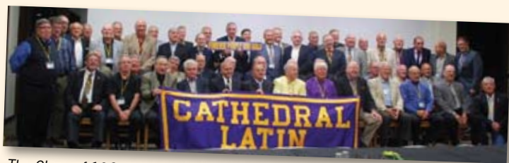
The Class of 1960 held its 50th reunion at NDCL.