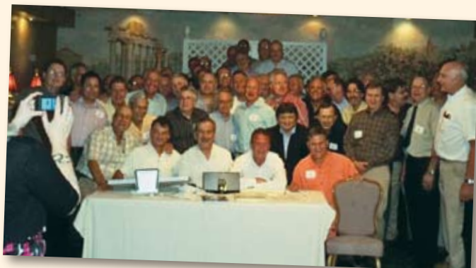
The Class of 1970 held its 40th reunion at Angelo's Nido Italia.