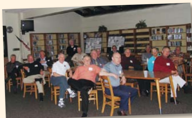
The Class of 1955 held its 55th reunion at NDCL.