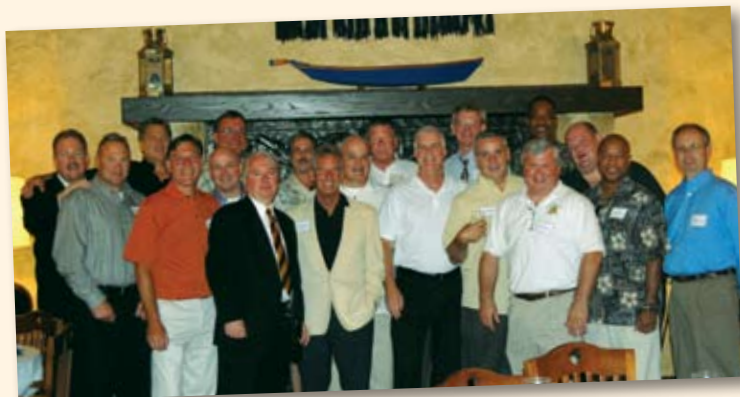
The Class of 1975 held its 35th reunion at Mentor Harbor Yachting Club.