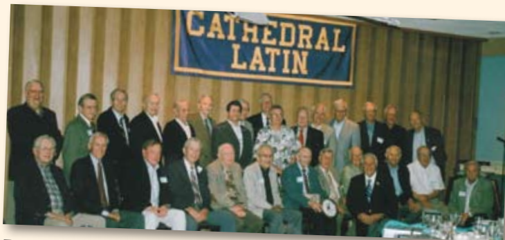
The Class of 1950 held its 60th reunion at Lakeside Yacht Club.