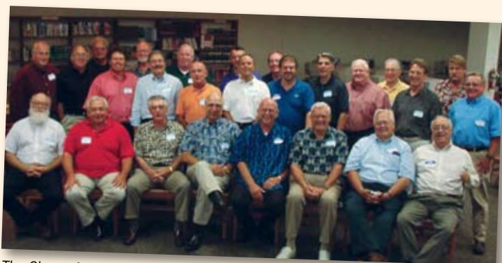
The Class of 1959 held its 50th reunion at NDCL.