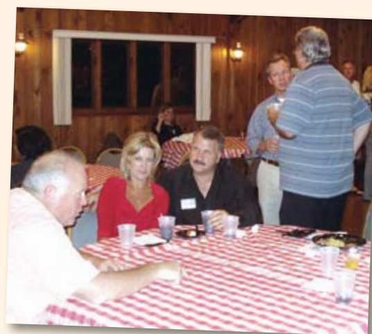
The Class of 1974 held its 35th reunion at the Manor Party Center.