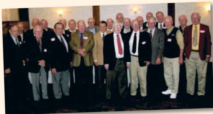
The Class of 1944 held its 65th reunion at Wellington Restaurant.