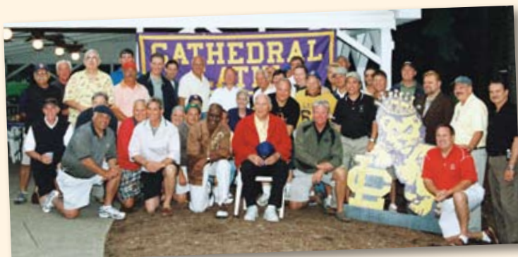
The Class of 1969 held its 40th reunion at Chardon Lakes Golf Course