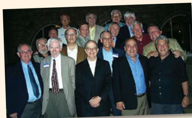
The Class of 1964 held its 45th reunion at the Shoreby Club.