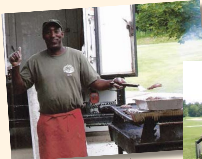
Winking Lizard cooking up some great food at the golf outing.

For more information, please contact Sue at the Alumni Office.