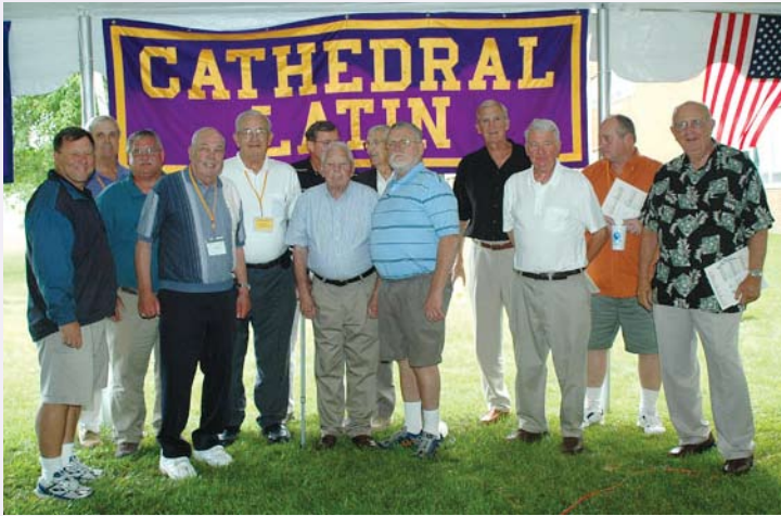
Past Hall of Fame inductees.

Congratulations to the Hall of Fame Class of 2009!