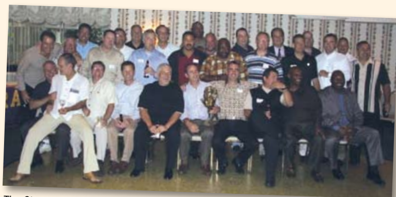
The Class of 1979 held its 30th reunion at Borally's Party Center