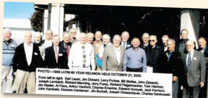
The Class of 1949 held its 60th reunion at Wellington Restaurant.