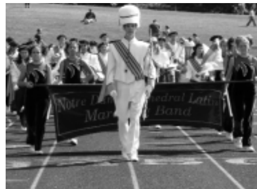
Led by spirited performances from the NDCL marching band and football team, the 2003 Hall of Fame Day was a grand success.

members of the NDCL community. The ceremony concluded with the playing of “Taps.”