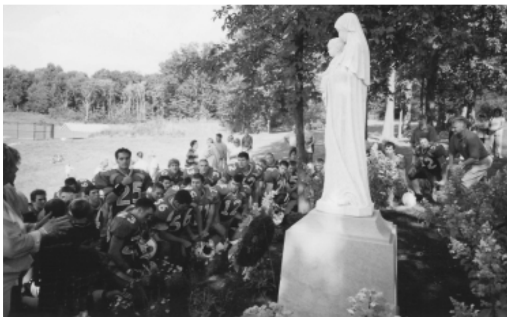
For the first time since 1978, victorious Lion gridders gather before the statue of the Blessed Virgin to offer a prayer of thanksgiving.