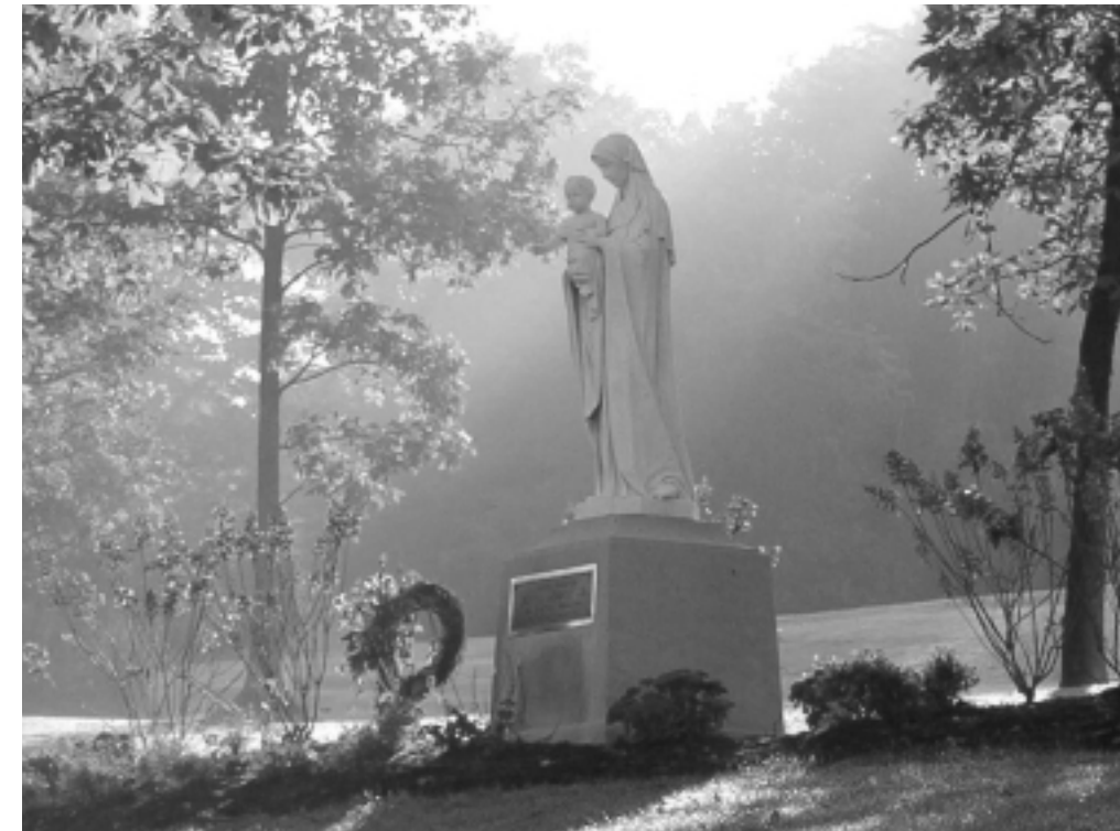
The familiar statue of Mary and Jesus that used to stand in front of the Marianist residence behind Cathedral Latin School has been refurbished and re-dedicated on a hillside overlooking Lions' Stadium on the campus of Notre Dame-Cathedral Latin School.

to share the successes that the school had in bringing alumni to the campus for the Kickoff Cookout (Aug. 9), the Hall of Fame Day at NDCL (Sept. 6) and Homecoming Weekend (Oct. 11-12).