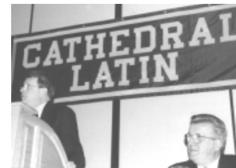
Communion Breakfast speaker U.S. Senator Michael DeWine (left) addresses attendees.

"A truly outstanding Communion Breakfast" was the most frequently heard comment by the Latin alumni and friends attending the 49th annual Alumni Communion Breakfast held April 9.