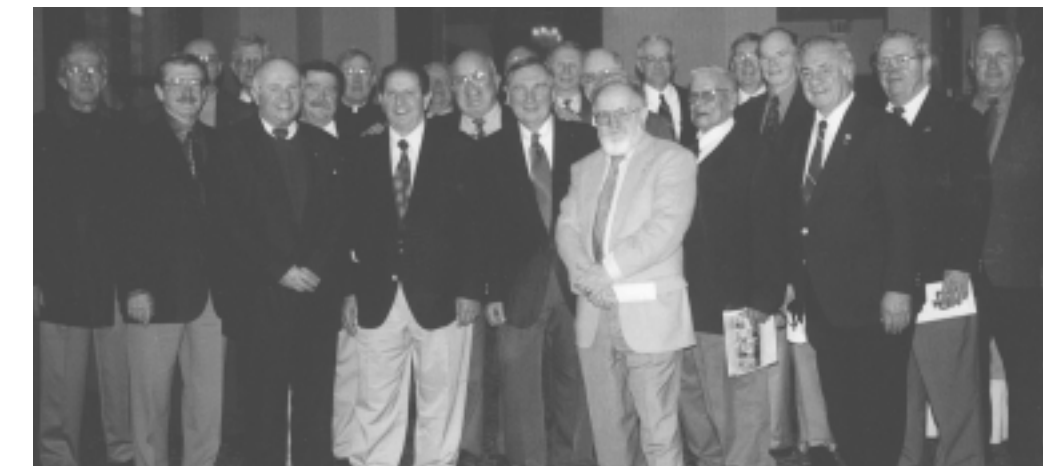
Members of the golden jubilee class of 1950 were honored at the Communion Breakfast.

Mark your calendar to attend next year's 50th annual Alumni Communion Breakfast on April 29, 2001.