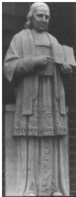
Rev. William Joseph Chaminade, Society of Mary founder.